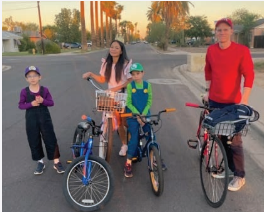
Halloween Bike Ride

The CNA is proud of the community engagement we've seen over the last year.